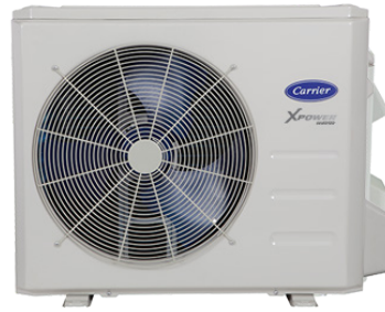
18K to 36K